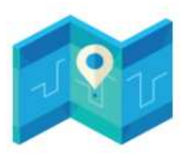
Do you provide a Local Service?