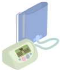
Health and Care

http:// helpyourself.bracknell-forest.gov.uk