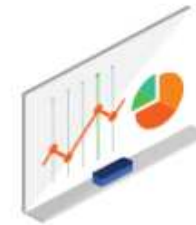
Work, Training & Volunteering