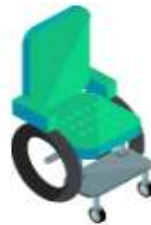
Products for independent living