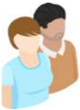
Find a Personal Assistant