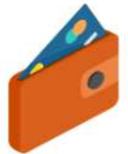
Money & Benefits